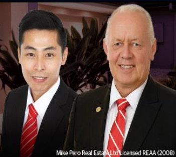
Mike Pero Real Estate Ltd Licensed REAA (2008)